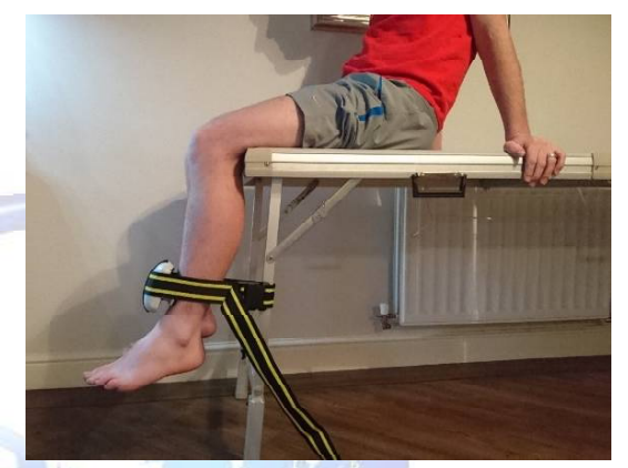
Fig. 2: Hand Held Dynamometer Hip Abduction.

Fig. 1: Hand Held Dynamometer Knee Extension.