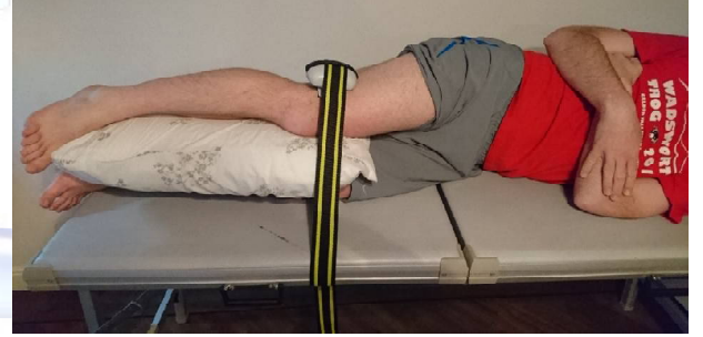
Fig. 3: Performance on the modified Star Excursion Balance Test (SEBT) on the left leg using the Y balance test system on the: