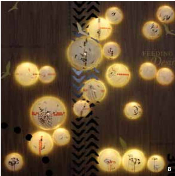
7 Andor Technology, Solas installation, Belfast, Northern Ireland, 2005. 8 Feeding Desire lighting installation, slip-cast porcelain, custom and handcut decals, 2006.

a run of limited edition purple prints matched to a Pantone reference so the client knew exactly what color they were getting. I also use digital prints at times to test ideas before production. Given the choice however, I always opt for screen-printed transfers over digital prints for quality. My first love though is hand cutting transfers—I find the process infinitely satisfying.