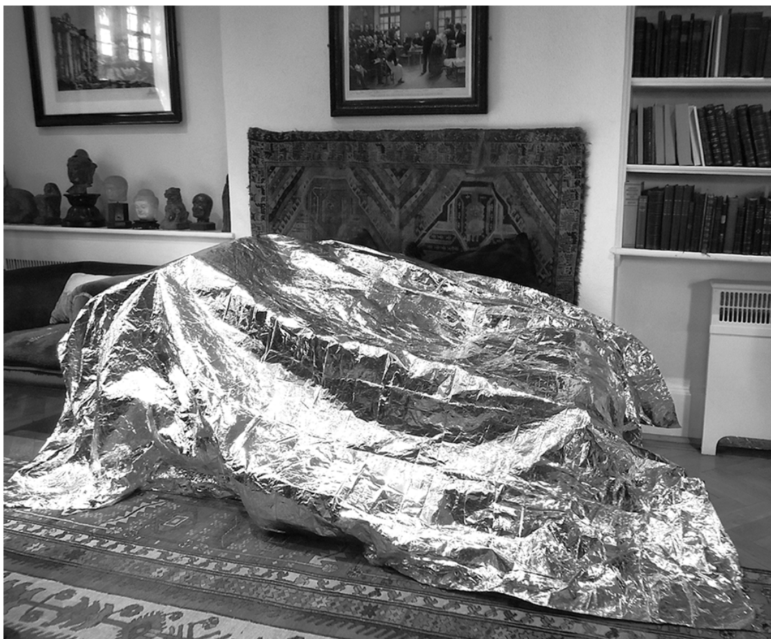
Figure 1: Brass Art, Freud's couch, performance still, Freud Museum, London, 2014.

except for the data or the image captured during our sojourn (Figure 1). Our collaborative entity emerged from a shared desire to occupy inaccessible vantage points. Assisted by digital compositing, shadows, drawings and model making, we created our doubles to dance and loom over imaginary landscapes (Brass Art 2000/2005, 2007, 2011). The artist is often afforded privileged access by dint of their audacity to ask, and ability to reanimate a collection with a fresh perspective. Thus, we interject, interpose or interrupt the equilibrium, the narrative, the silence, and the spaces between and beneath. We enter a dialogue to discern what we can touch, move, displace, juxtapose, unlock, open up or reveal.