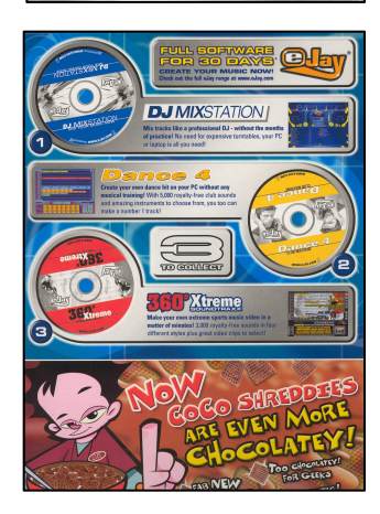
Fig. 1: Nestle Shreddies Promotion, June 2003.