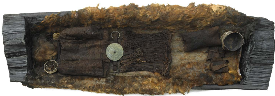
Figure 2. A photo of the remains of a Bronze Age high status female found inside an oak-coffin in a monumental burial barrow at Egtved, Denmark. The Egtved Girl's garments are extremely well preserved and her exceptional wool costume consists of several wool textile pieces as well as a disc-shaped bronze belt plate, symbolizing the sun.