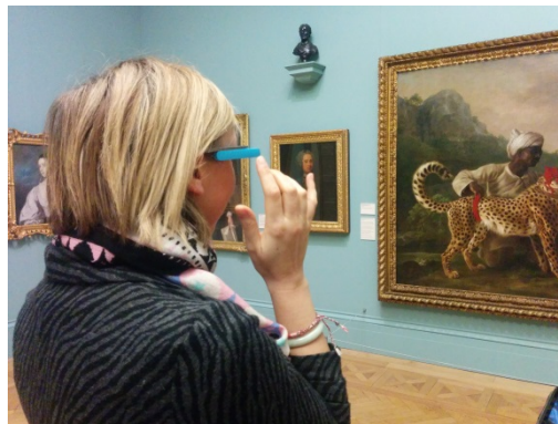
Figure 2. A participant experiencing the Google Glass AR application