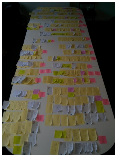
Figure 3. Affinity Diagram