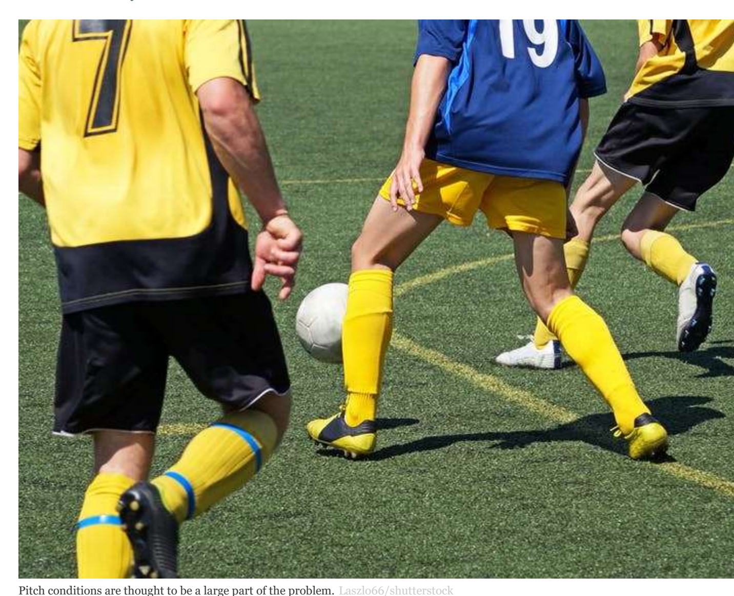
Rising costs alongside poor and irregular playing opportunities means a poor experience for players. And football is <u>much like any other sport</u> in that participants want and need a positive experience. And with the wealth of alternative sporting options and services available, if they don't get what they want, they will simply do something else.

In Merseyside for example, <u>Liverpool City Council proposed to cut 1,500 jobs</u>, including the majority of full-time parks staff that take responsibility for the football pitches. And across the River Mersey in neighbouring Wirral, the borough council increased the costs of football pitch fees – a decision met with <u>objection by the Cheshire County FA</u>.