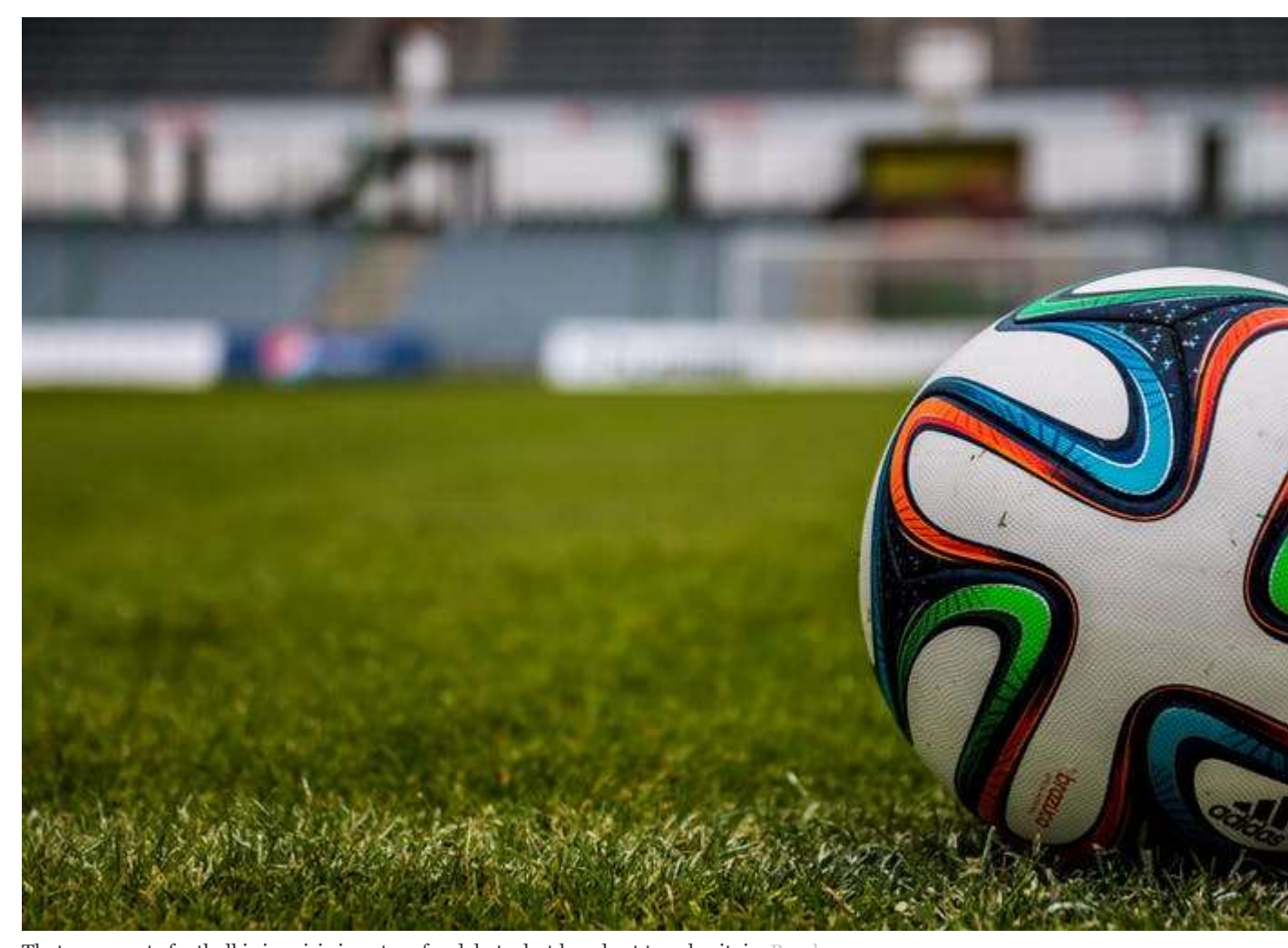
That grassroots football is in crisis is not up for debate, but how best to solve it, is.

This comes as part of a national football effort, including further investment from the Football Foundation – which receives \underline{\pounds_{12m}} a year from both The FA and the Premier League, and \pounds_{10m} from the government. On top of this, the Premier League has also committed up to \pounds_{1} billion investment in grassroots football (and sport) as part of its \pounds_{5.5} billion three-year TV contracts.