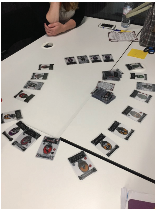
Figure 1. Keith Baker's Gloom , played with each set of cards facing the other players, which was suggested for enabling a more playful experience. Note also the circular placement of the cards, appearing to create a large, combined family.

Second, we thought that a tabletop game would be easily changed and adapted by players, especially during the process of play. This allows more flexible relation to the rules than might occur in digital games. Accordingly, while the rules of an analogue game might initiate play (regulated, competitive play), they also initiate the possibility of playing with (rather than within) the rules in a manner that is perhaps less straightforward in digital games. Juul's (2005) description of digital games illustrates this well, suggesting that 'rules are designed to be objective, obligatory, unambiguous, and generally above discussion' (p. 121). Players of video games can and will play in ways that are contrary to the expectations of a game's designers, but this is the exception rather than the norm and without access to the game's underlying code even these forms of 'subversive' play usually remain within the parameters of the game as designed. Again this was evidenced by Gloom where, as shown in Figure 1, players were easily able to adapt and modify the game to suit their playing experiences. Had we instead elected to play a digital game with its own set of rules and gaming mechanics, such