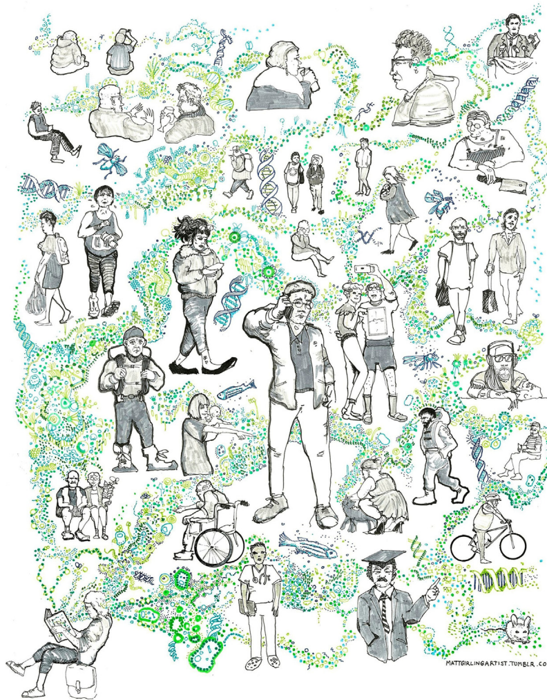
Fig. 1. Cover illustration by Matt Girling.

"The idea behind the cover art image is to represent the communication of biology to the general public. To show the public as accurately as possible I have worked from sketches that I made of the people of Manchester, including a teacher, a clinician and a politician as they are key figures for which it is particularly important to communicate information to. The representation of "biology" is expressive and abstract; as an artist and a non-expert in biology I looked for a way to depict scientific knowledge as a mysterious and intricate energy to catch the eye of somebody who might ordinarily have no interest in biology. A zebrafish, fruit fly and mouse have also been included as they have special relevance in many areas of biological research." (Matt Girling, mattgirlingartist.tumblr.com ). To add to this, we, the authors, also feel that these images relate to the spirit of illustrations drawn for Alice's Adventures in Wonderland , thus referring to a time in the second half of the 19th century that was particularly open to discovery, curiosity, science and technology.