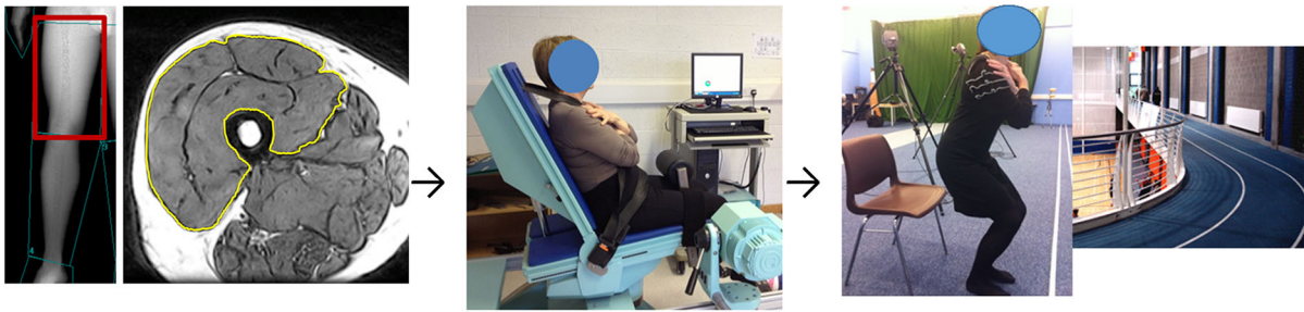
Fig. 1 Upper leg lean tissue mass (iDXA; University of Limerick Body Composition Study) and quadriceps skeletal mass (MRI; Manchester Metropolitan Healthy Ageing Study), knee extensor torque (isokinetic dynamometry; University of Limerick Healthy Ageing Study), extended chair rise and gait

speed tests (University of Limerick Healthy Ageing Study) appear to represent the indices of lower extremity muscle mass, strength and function responsive to age-related change and therapeutic intervention