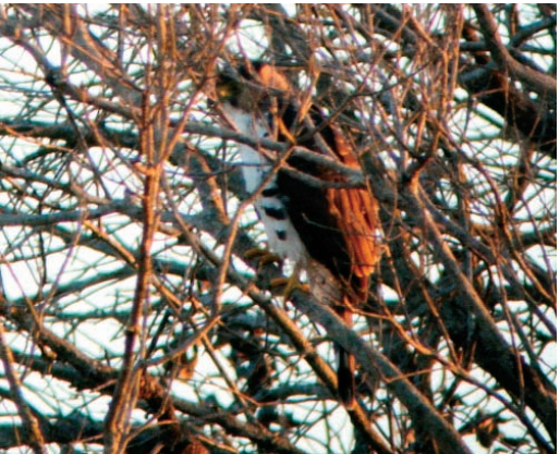
Figure 3. Juvenile Grey-bellied Hawk Accipiter poliogaster , Serra dos Caiabis, August 2006 (A. C. Lees)