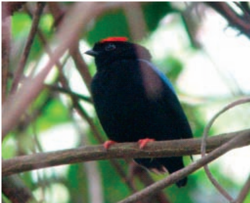
Figure 4. Adult male Blue-backed Manakin Chiroxiphia pareola , Serra dos Caiabis, July 2006 (A. C. Lees)