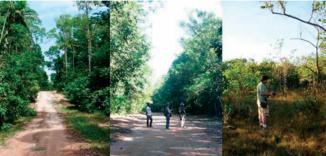
Figure 2. General aspect of primary vegetation types on the Serra dos Caiabis, including a continuum of tall forest (left) to open herbaceous caatinga (right) (A. C. Lees)