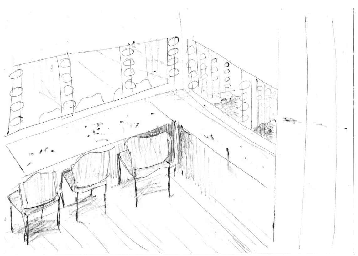
Figure 1: Spirit of Theatre: Dressing Room.

variations to prompt memories of the particular shows under consideration. A further set of questionnaires was sent to audiences of five shows, staged by each of these Companies at least one year earlier, offering us a long-term comparison of audience memories.