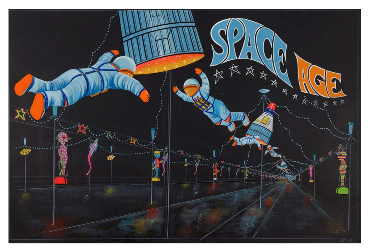
Figure 2: Design for Space Age, 1970s