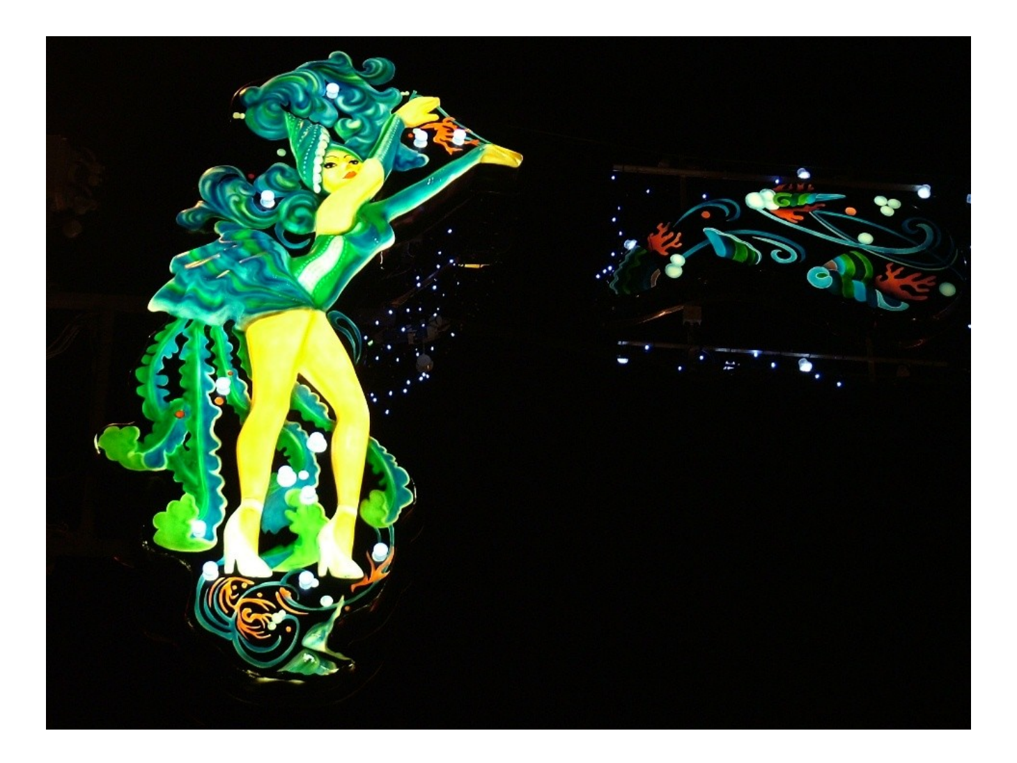
Figure 3: DecoDance, 2007