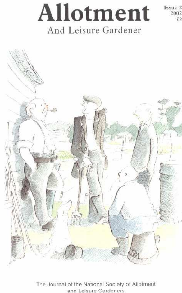
Figure 1: Allotment and Leisure Gardener , The Journal of the National Society of Allotment and Leisure Gardeners , 2002, Issue 2

presented in the mass media. Even the allotment community itself does little to discredit this stereotype. In 2002, a cover of Allotment and Leisure Gardener , the journal of the National Society of Allotment and Leisure Gardeners, showed four 'typical' allotment holders, all elderly men, one wearing a flat cap and another smoking a pipe. In keeping with this image, the journal also features a regular column titled 'Old Pete's Ramblings'.